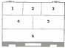
Pin Diagram This applies to all kits.

Additional kit information at www.pricerlists.com or contact a TE Connectivity authorized distributor